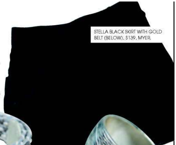
STELLA BLACK SKIRT WITH GOLD BELT (BELOW). $139, MYER.

go past timeless black for an item of clothing that will keep on giving. Pip's advice to get the most out of your little black skirt: "Keep the outfit modern and chic with emphasis on accessories to update your look. Don't be afraid to wear cute flats for the day to keep your feet rested so your heels can come out and play at night. If short skirts aren't your thing, tailored shorts are just as good."