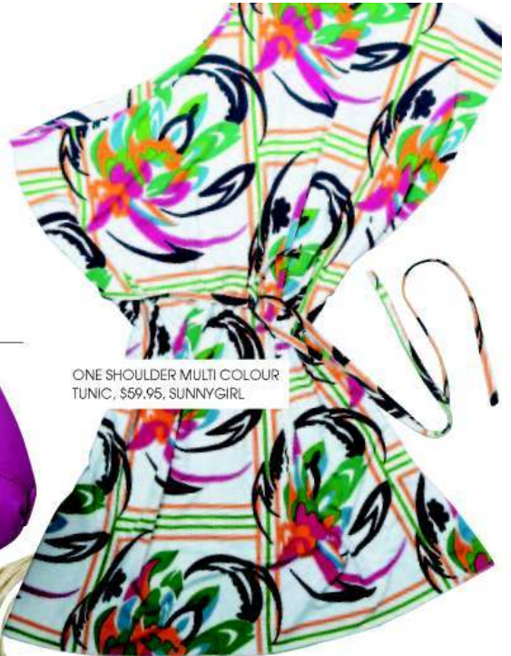
ONE SHOULDER MULTI COLOUR TUNIC, $59.95, SUNNYGIRL

a flirty evening look to an effortlessly chic daytime number, perfect for lunch with the girls or a trip to the beach. Craig says: "This look is all about 'daring to bare' while keeping a little something 'tucked' away. Visually, it creates an alluring effect akin to a plunging neckline on a full gown or peep toe pumps. This is a look that's both sexy and fun. The dress I've used is from SunnyGirl."