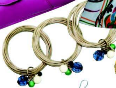
BY NIGHT: THESE JADE HEELS ($49.95, BARKINS) REALLY ADD GLAMOUR TO OUR CASUAL ONE-SHOULDER DRESS. TO KEEP WITH THE 'BRIGHT BY NIGHT' THEME I'VE ADDED ASSORTED GROUPS OF OLD GOLD BANGLES, AN ORCHID CLUTCH AND DISC EARRINGS (ALL $19.95EA FROM BARKINS).